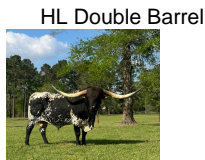
HL Double Barrel