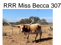
RRR Miss Becca 307