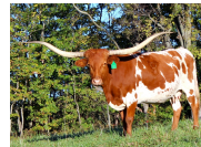
HUNT'S RESPECTED DIANNE