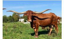
HUBBELLS RIO GLORY