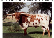
IMPACTS REAR ADMIRAL