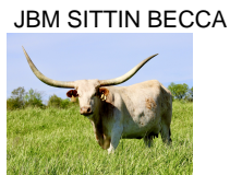
JBM SITTIN BECCA