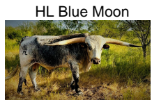
HL Blue Moon