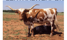
HUNTS MISS LEATHALWEAPON